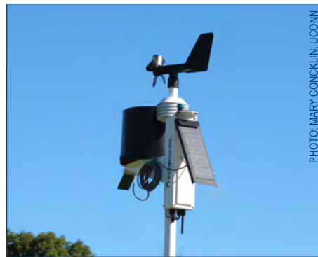
A Rainwise Weather Station

Yes! NEWA interfaces with RainWise stations. Find out under “About Weather Stations” at newa.cornell.edu . Contact us to learn more.