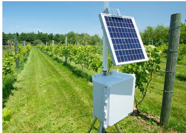
Figure 1. Cellular interface (telmet) weather station.

Many NEWA station owners have upgraded to the IP-100, but some continue to use the FTP system which logs data to their computer. New from RainWise in 2013 - 2014, is a cellular modem equipped instrument (Fig 1) which can be stationed anywhere there is cellular communications. RainWise manages the cellular connections making for easy installation at the growers site. Two of these instruments are now in the network. One is located in Watkins Glenn and the other is located in Williamson.