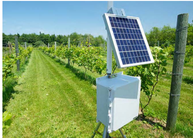
Figure 1. TeleMET weather station with cellular modem data transmission.

New from RainWise, is the TeleMET, a cellular modem equipped instrument (Fig 1) that can be stationed anywhere within the cellular communications coverage area managed by RainWise. The cellular data plan makes for easy installation at the grower's site. Three of these instruments are now in the NY network, in Watkins Glen, Williamson and Clintondale. Existing AgroMET instruments can be upgraded to the TeleMET.